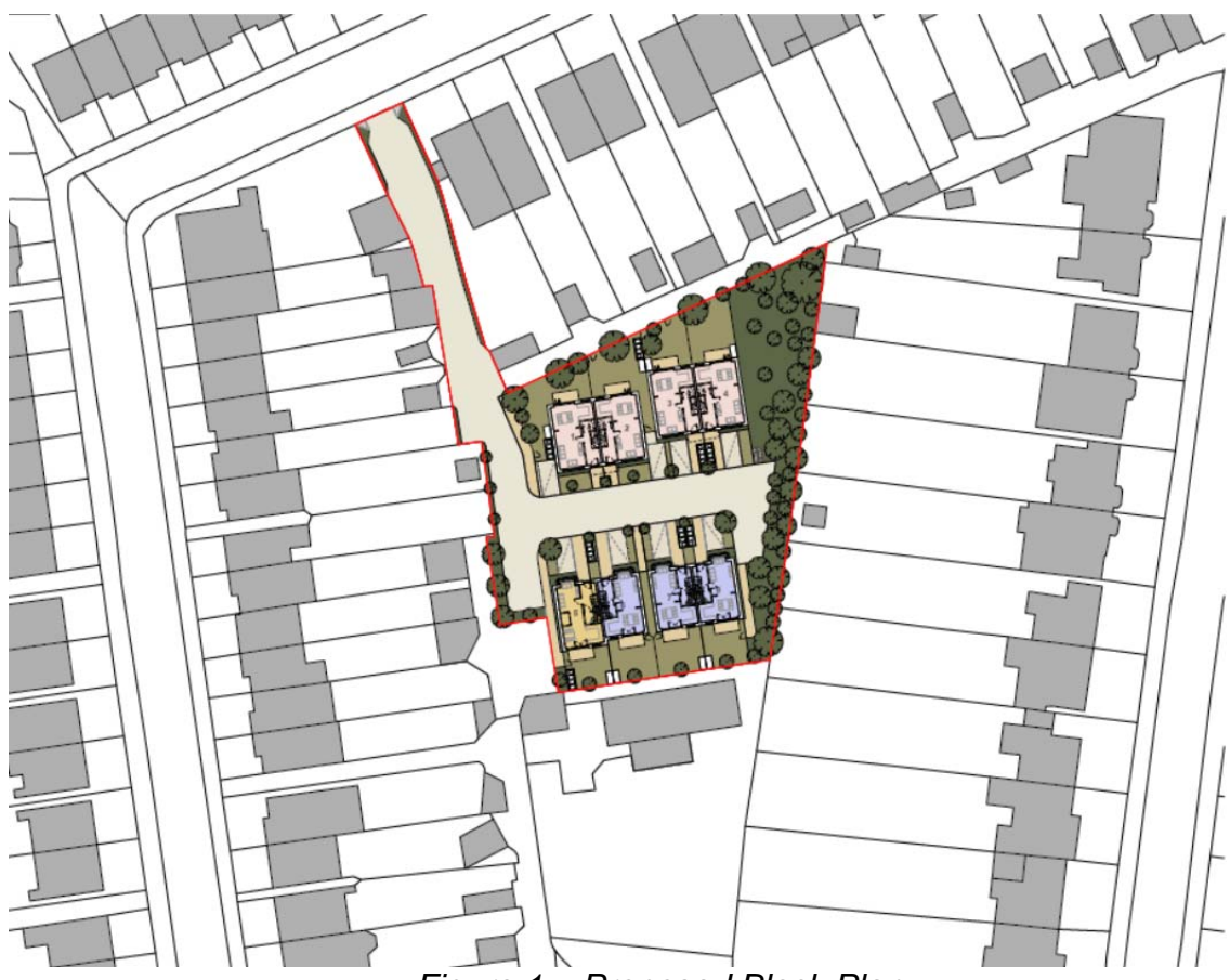
Figure 1 – Proposed Block Plan