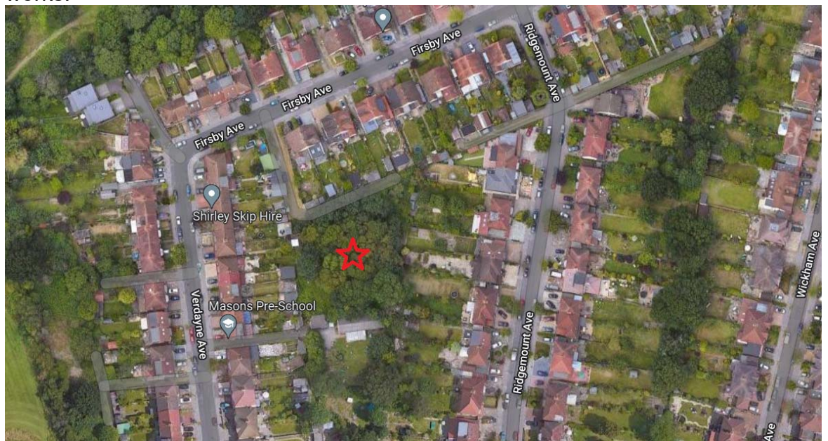
Figure 2 – the application site

3.5 The application site lies on the southern side of Firsby Avenue and is occupied by a vacant piece of land which has been subject to previous clearance works, as such the site has very little to no ecological or biodiversity value. From looking at historic maps it can be reasonably assumed that the site to the rear was previously occupied by tennis courts, which had become overgrown with scrub and self-seeded trees. Whilst this area had become unkept its verdant and semi-wooded character did contribute to the character of this part of Shirley North. It should however be noted that the trees within the site were not subject to a Tree Preservation Order nor is the site within a Conservation Area which would have provided a level of protection to the trees within the site. Therefore, whilst the removal of these trees and soft landscaping is regrettable (and not a practise officers condone) there is nothing to stop a landowner doing such clearance works.